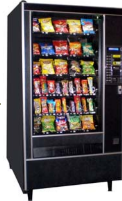
NEW VE LED Lighting System