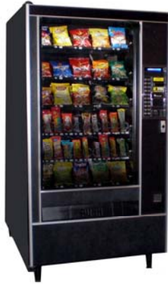
Traditional Fluorescent Lighting